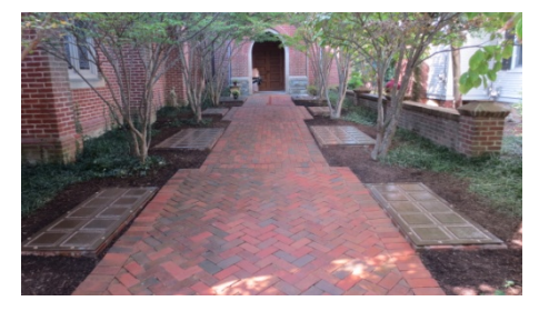
The finished columbarium