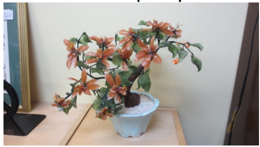
Jade Bonsai Tree