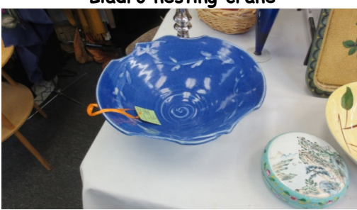
Hand crafted pottery bowl