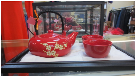
Japanese tea set