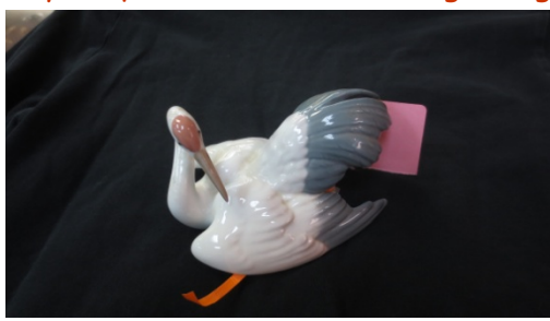
Lladro nesting crane

The Bargain Box frequently receives donations of very unique items which make great gifts.