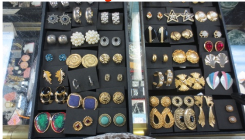
Jewelry, including clip earrings

Donate your gently used items to The Bargain Box.