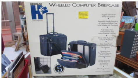
Wheeled computer briefcase